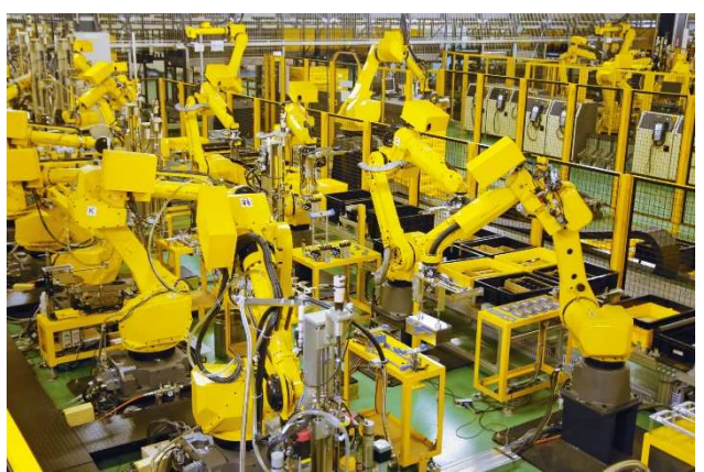
Figure 2 Automated assembly process [1]

Automated systems increase production efficiency in factories and reduce the time-consuming nature of manufacturing operations. At the same time, these systems improve working conditions and increase safety. They also form an indispensable unit in quality control. Employees would have to expend many times more effort to achieve in a shift what they can now achieve with automated industrial systems. Production would be much more difficult and dangerous overall [3].