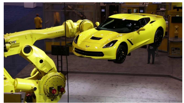
Figure 5 Robot with a load capacity of 2300kg [12]

Classical industrial robots have unrivalled performance that cannot be achieved by workers. These parameters can be described with a few examples: